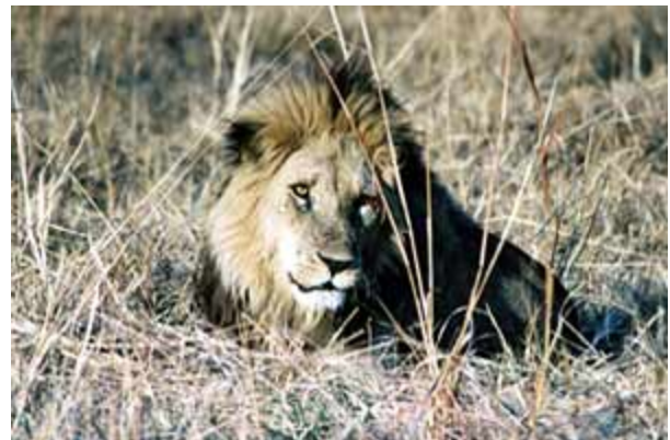
Lion – Kalahari