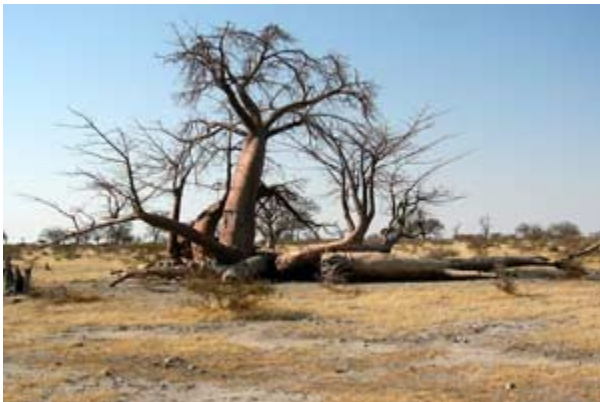
Baobab – Kubu Island