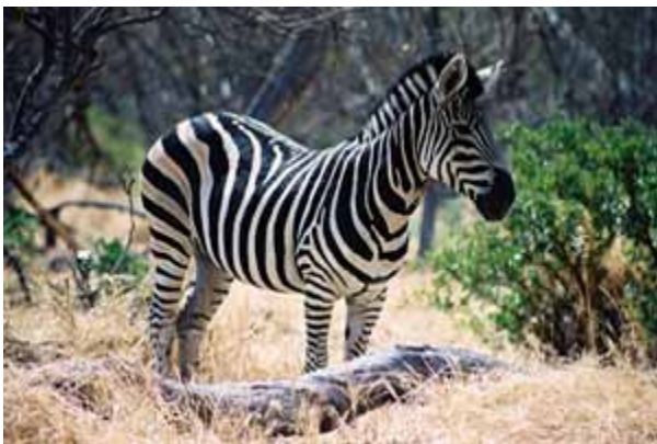
Zebra – Chobe